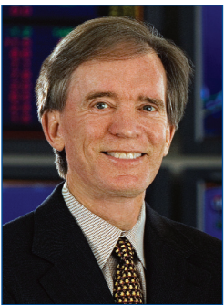
Founder and co-CIO, PIMCO

“Behind every great fortune lies a great crime.” —Balzac